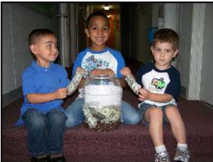
Nets for Life The children are doing a great job of donating .