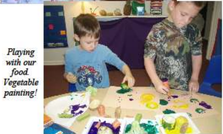
Playing with our food Vegetable painting!