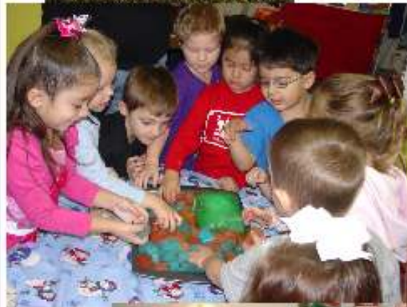
Building with ice cubes

Please let us know how you would like to help!